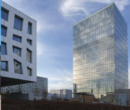
Rotkreuz, Professional Diagnostics headquarters